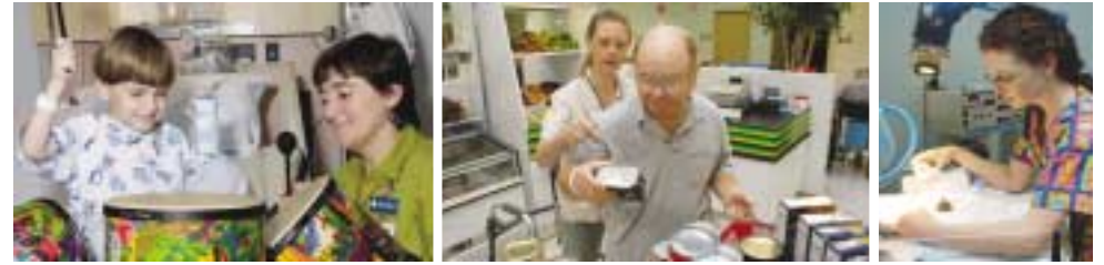
Healing Arts Network, Coastal Rehabilitation Hospital and Women's and Children's Services are just a few of the programs and services available that benefit from the work of the NHRMC Foundation.

Programs supported by the NHRMC Foundation include: