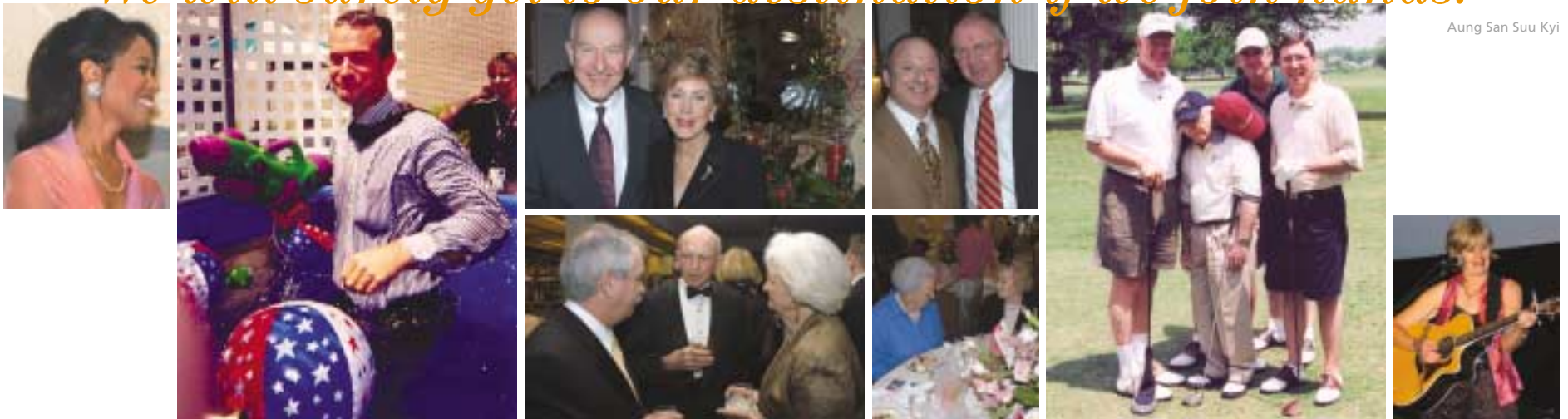
Aung San Suu Kyi

We will surely get to our destination if we join hands.